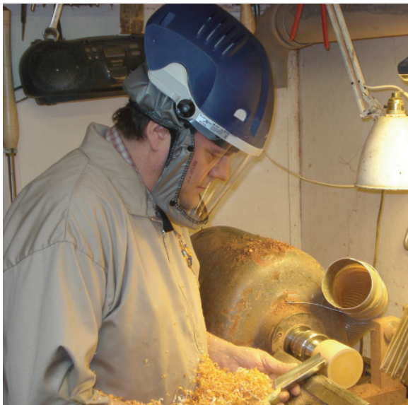
Woodworking and timber preparation - for protection against dust, flying particles, and preservatives