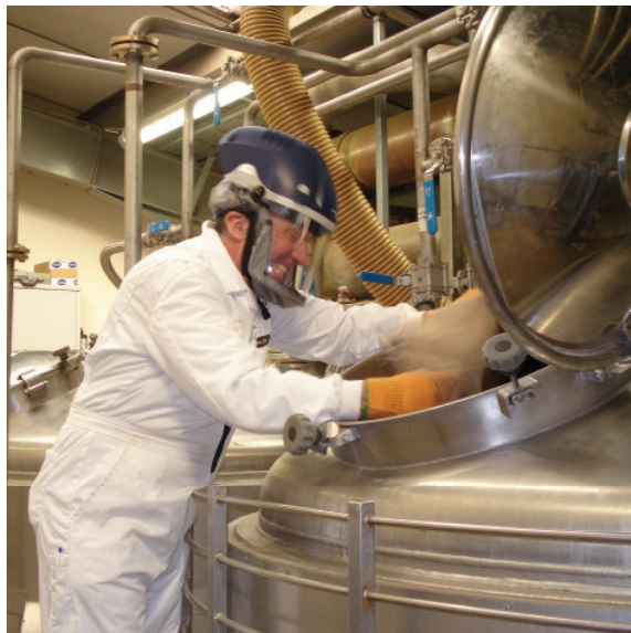
Food preparation and processing – for protection against powder inhalation and mixing splashing