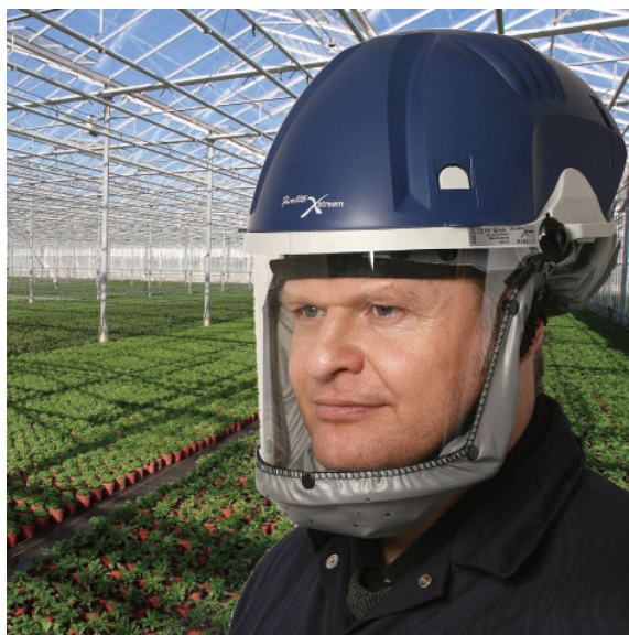
Agrochemical industry - the application of fertilisers and pest control treatments, harvesting and packing

The new Purelite Xstream is a self-contained lightweight Powered Air Purifying Respirator (PAPR) providing all-in-one respiratory protection against dust, fumes and particulates, combined with eye and face protection against impact and liquid splash.